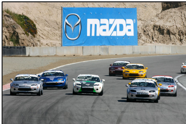
“MX-5 Cup restart at Mazda Raceway Laguna Seca”

You might find it hard to believe the recent Mazda commercial stating that more Mazda's are road raced on any given weekend than any other brand of car. Well, believe it or not this is indeed true. Mazda has ingeniously made the most of the pyramid of motorsports involvement.