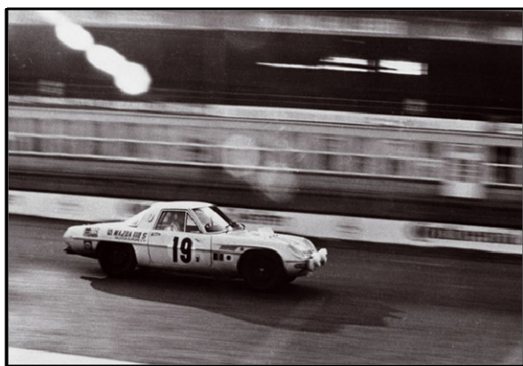
“Mazda Cosmo 110 at “Marathon de la Route”

They realize that the majority of the money in motorsports is spent at the grass roots level by thousands of weekend racers who are continuously trying to push their budgets to the limit. Mazda has catered to these groups by producing some true sports cars for the street such as the ever-popular mx-5 Miata as well as supporting racers at the grassroots level with programs like MAZDASPEED Motorsport Development which provides parts and services to those who race Mazdas. Mazda also participates in, and supports more forms of racing, and race series than any other manufacturer in the world and has created a development ladder allowing racers to progress all the way from karting and club racing to professional racing in both open and closed wheel racecars. However MAZDASPEED hasn't always been as popular as we know today. What we know as MAZDASPEED actually started over 40 years ago as a small independent race team in Japan.